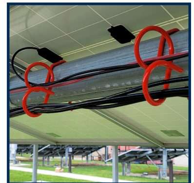
Torque Tube Hanger options shown here and above.

Contact our Solar Team at 814.472.5077 to learn more about Under Panel Cable Management solutions or for information about our full range of CAB® Solar cable management products.